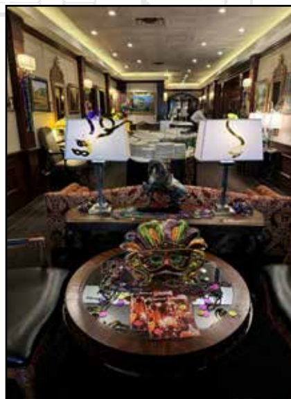
Mardi Gras at The Austin Club