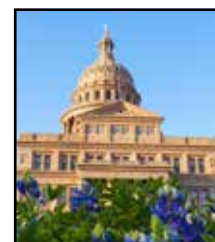
ON THE COVER Texas Capitol building with bluebonnets.

The service charge calculated on all food and beverage transactions is applied toward offering employees a higher hourly rate and used toward off-setting costs associated with employee benefits.