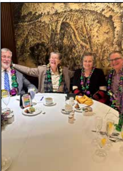
Mardi Gras at The Austin Club