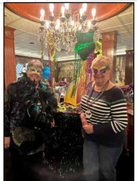
Mardi Gras Best Dressed