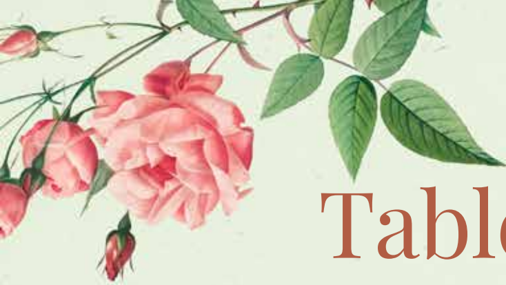
Table Side Carved Chateaubriand