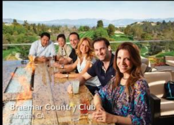
Braemar Country Club Fazenda, CA