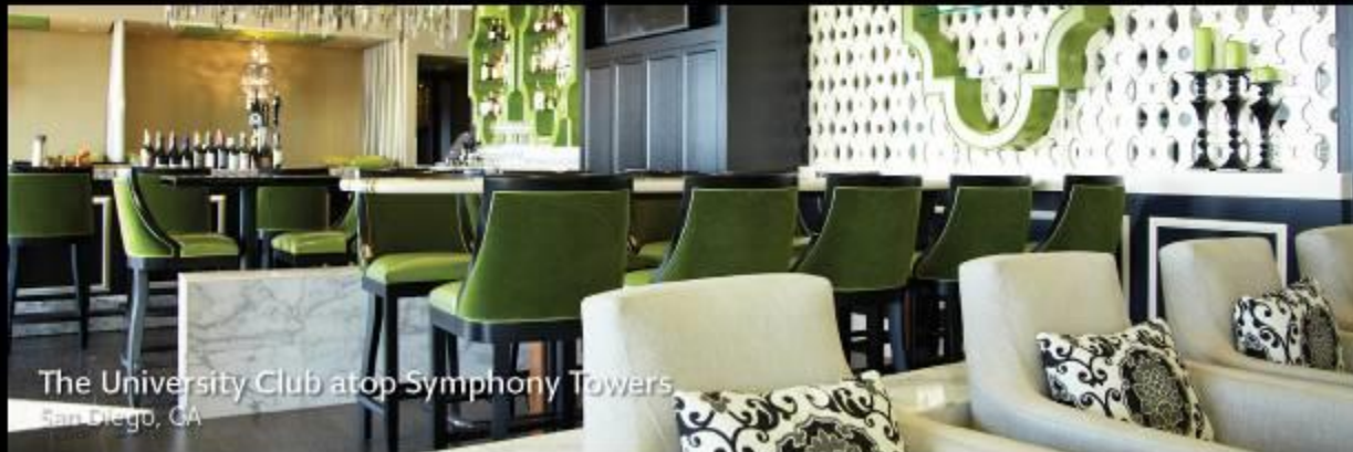
The University Club atop Symphony Towers San Diego, CA