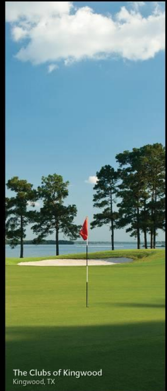
The Clubs of Kingwood Kingwood, TX